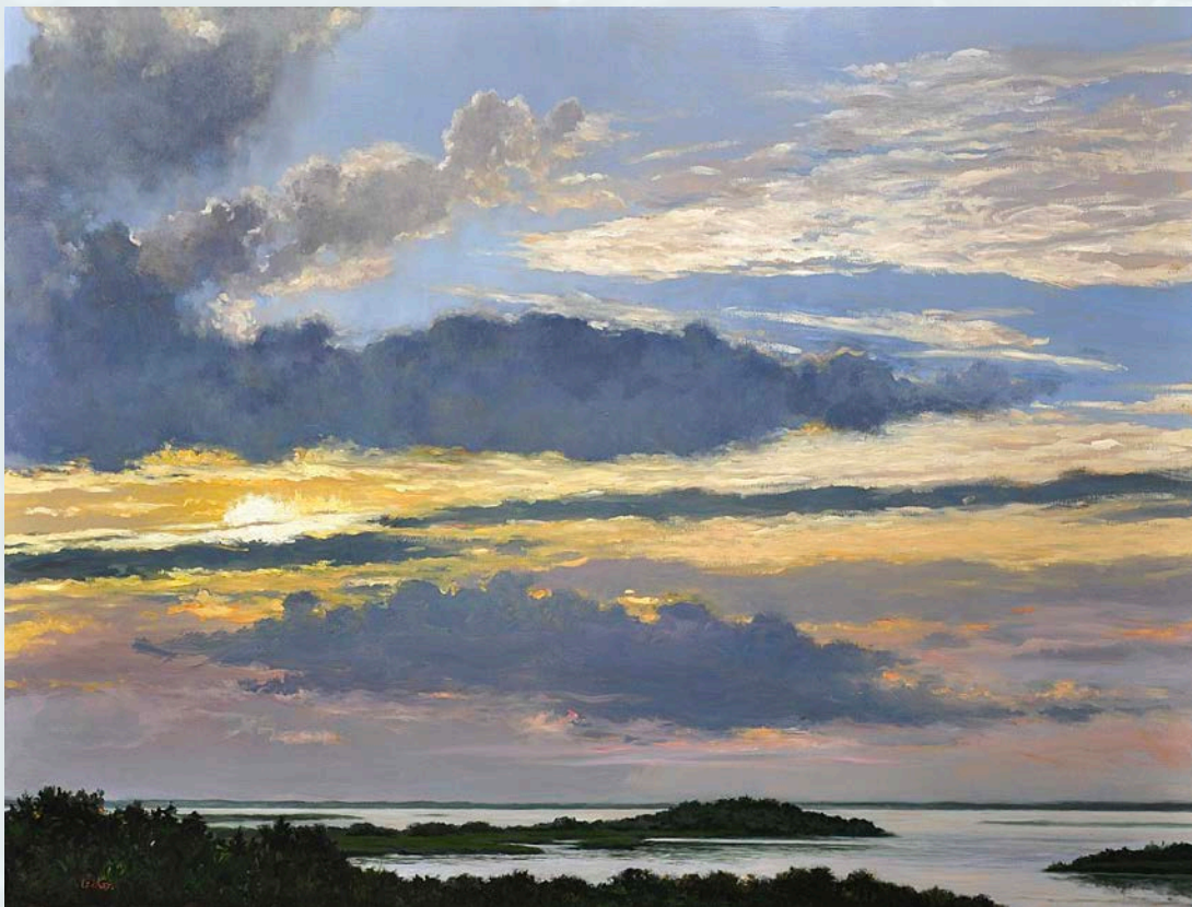
Sunset , 36 x 48, oil on linen, $25,000