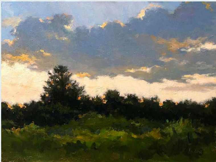
Study, Down by the Sea , 9 x 12, oil on linen, $2,200

Artist David Peikon and Cavalier Galleries are pleased to present