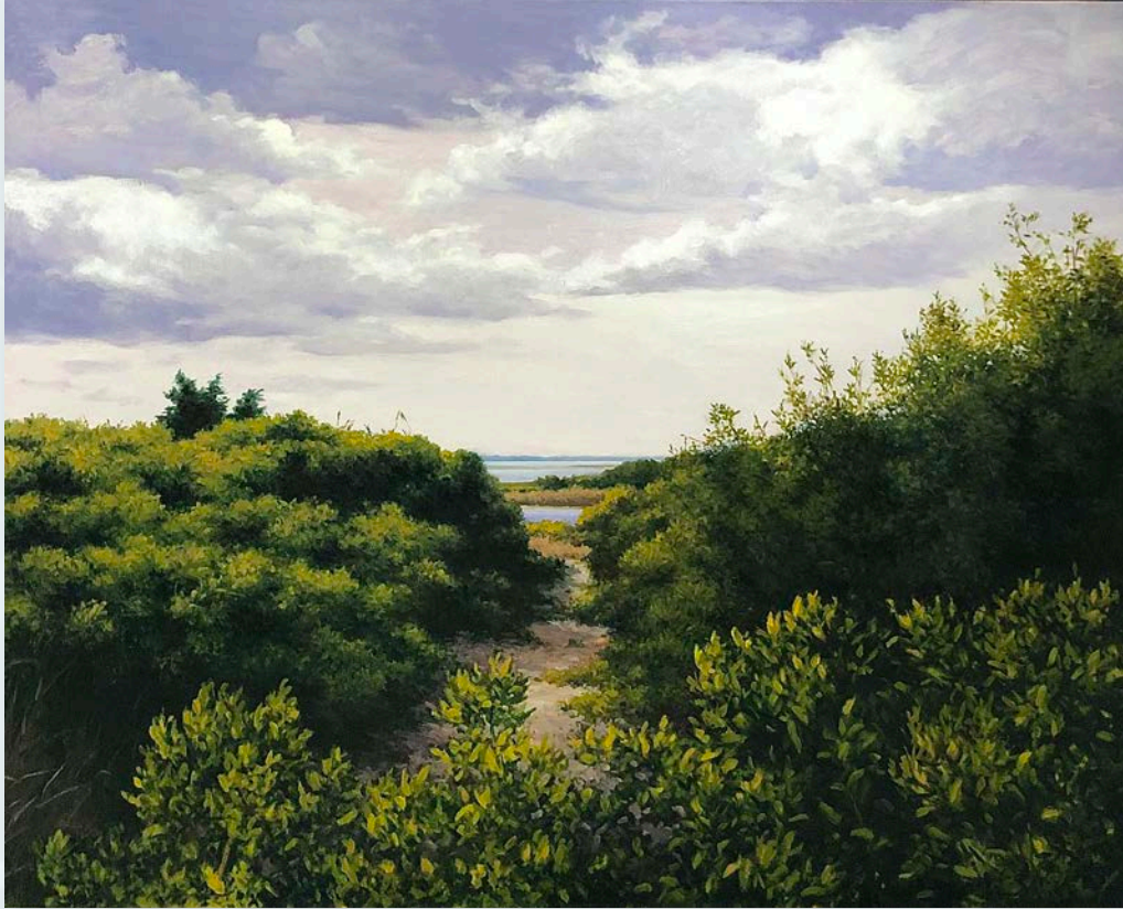
Water View , 40 x 50, oil on linen, $28,500