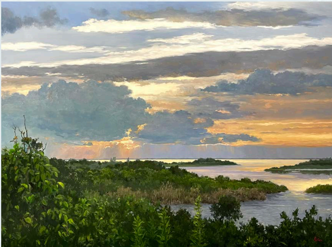
Remains of the Day , 36 x 48, oil on linen, $25,000