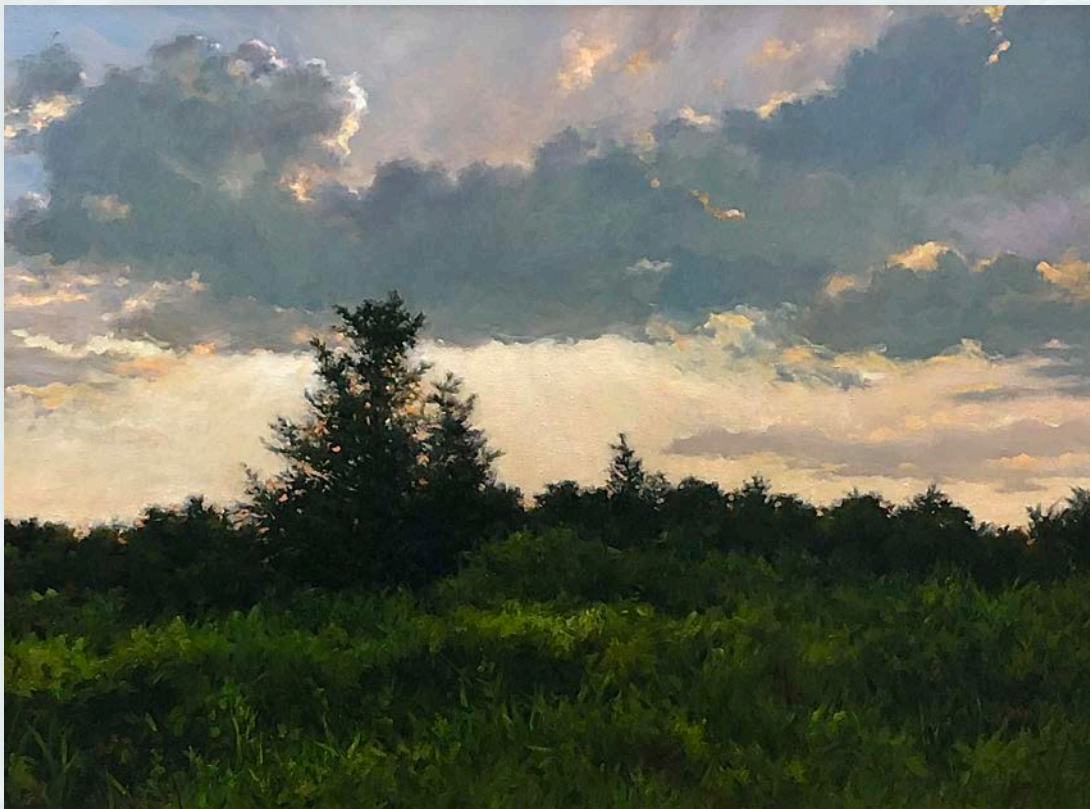
Down by the Sea , 36 x 48, oil on linen, $25,000