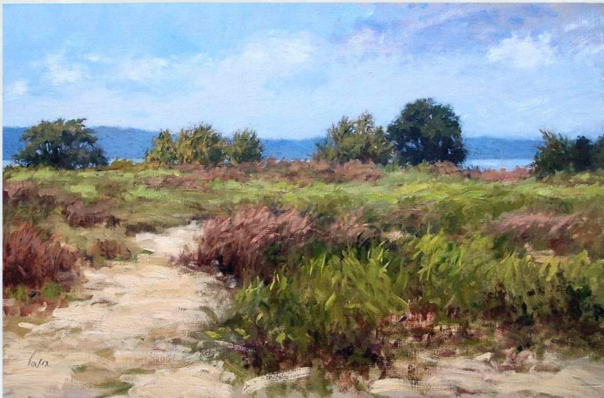
Harbor Walk , 12 x 18, oil on panel, $3,200