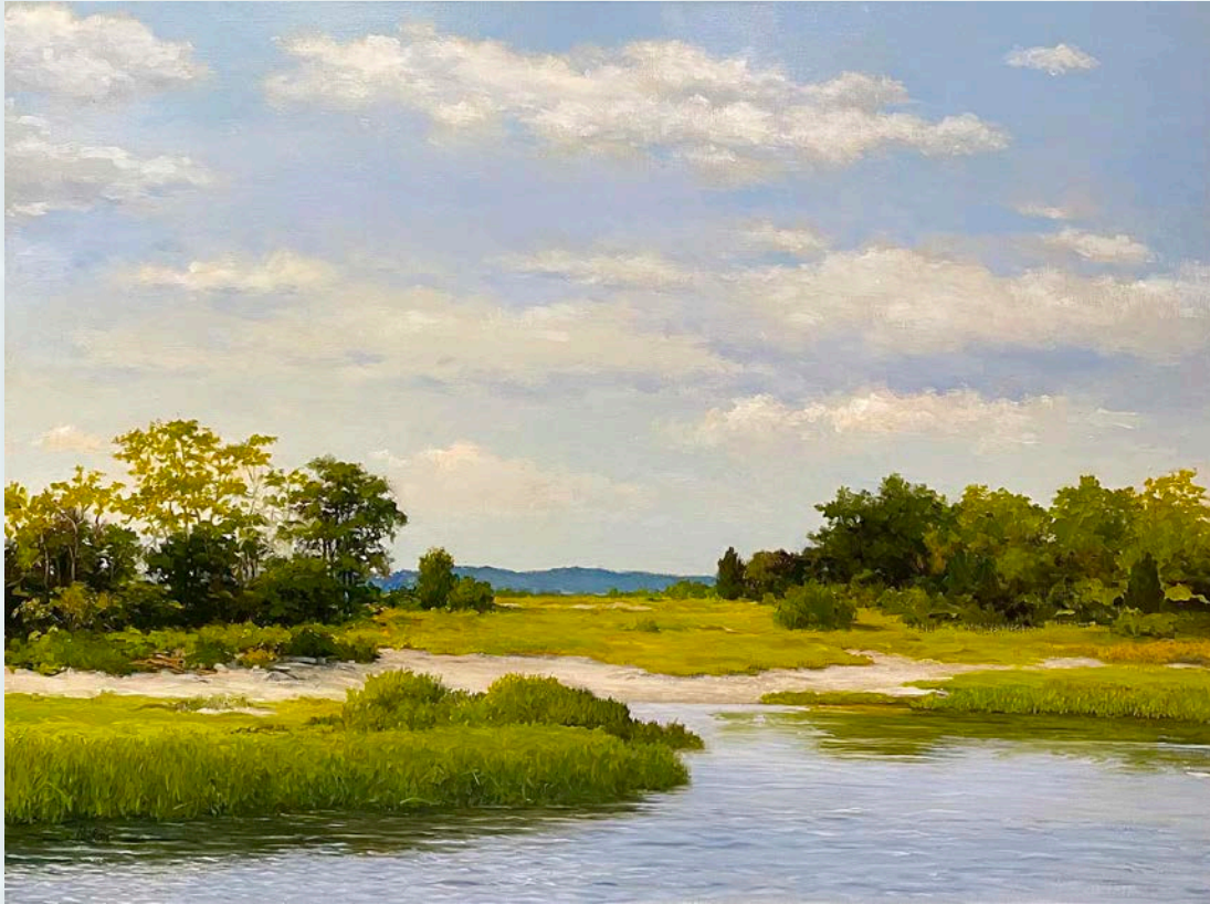
Stony Brook Harbor , 30 x 40, oil on linen, $20,000