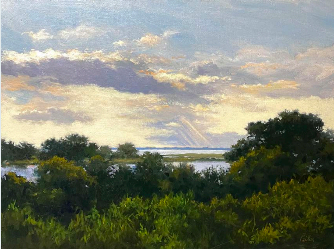
Break in the Clouds , 18 x 24, oil on linen, $6,000