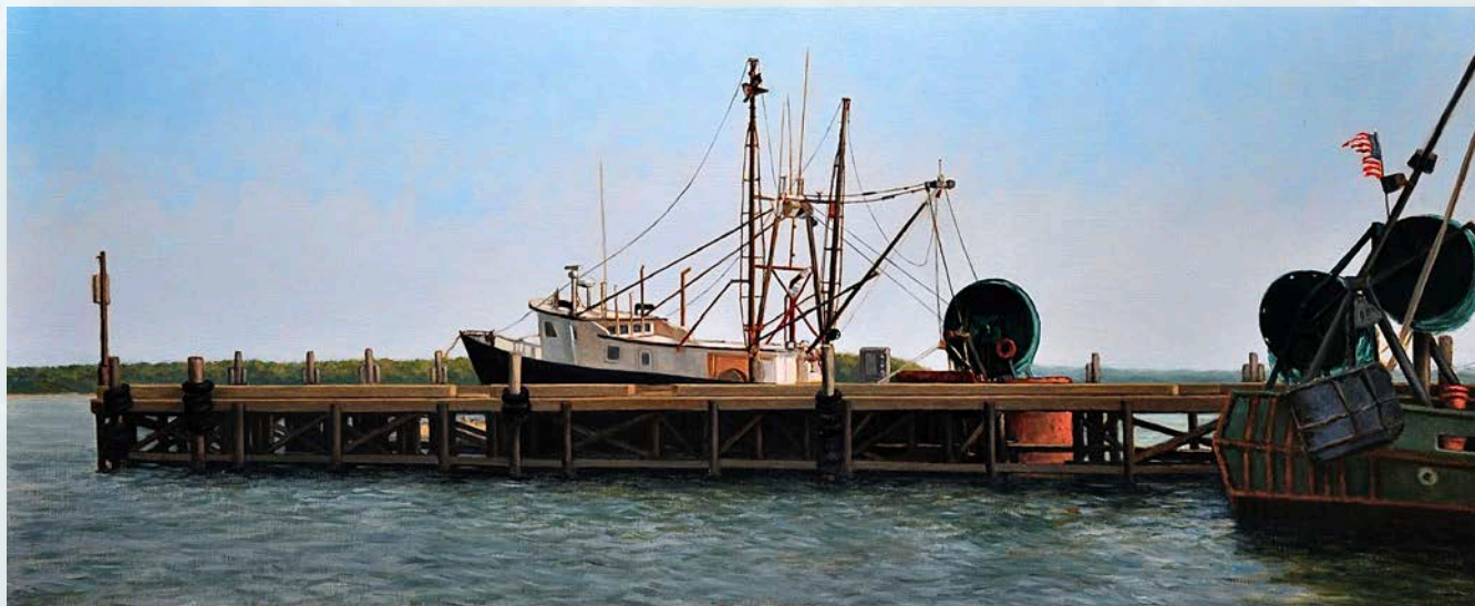
Trawler , 16 x 40, oil on panel, $10,000