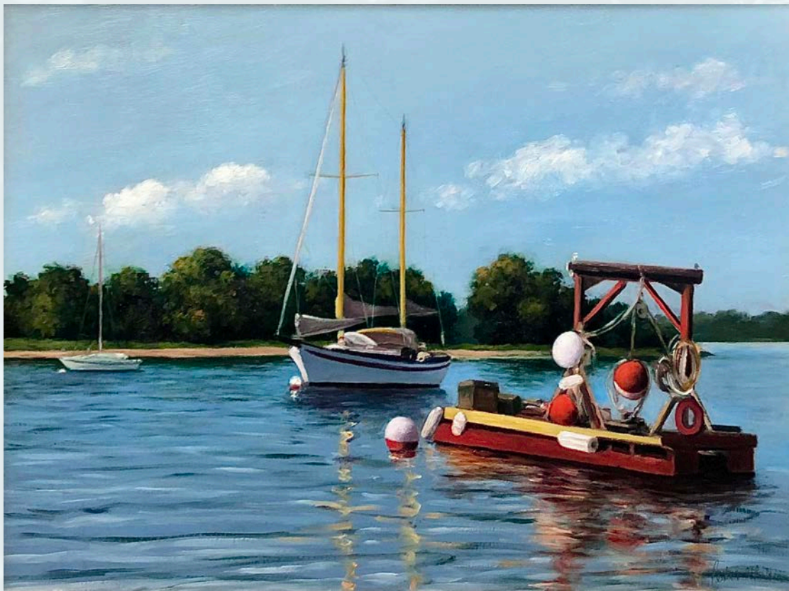
Work and Play , 18 x 24, oil on linen, $6,000