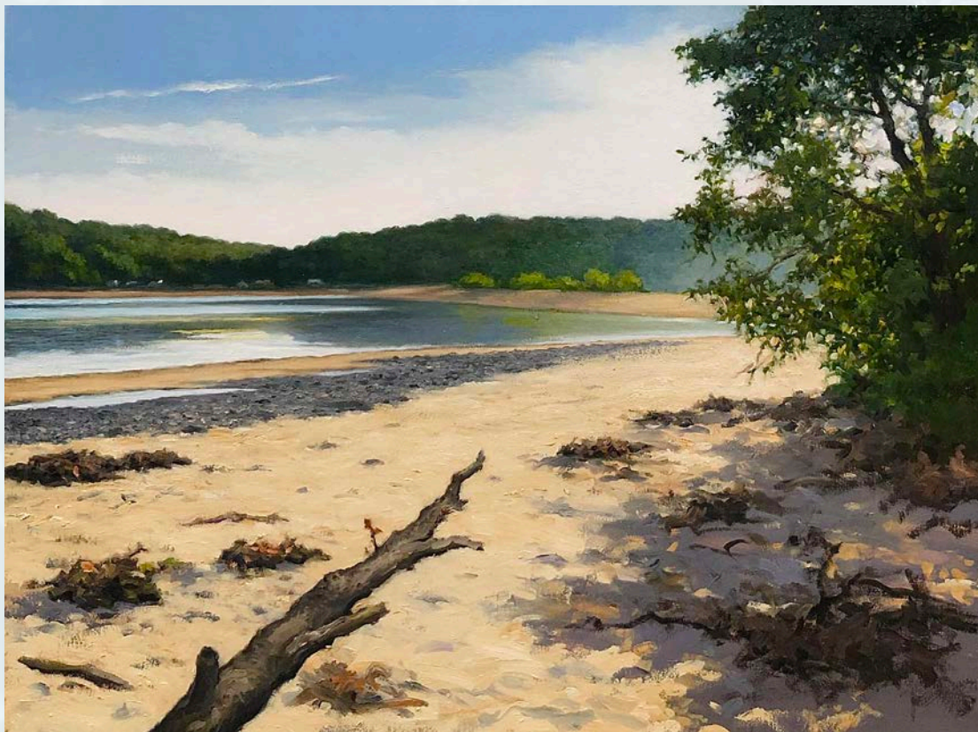
Morning Walk , 18 x 24, oil on linen, $6,000