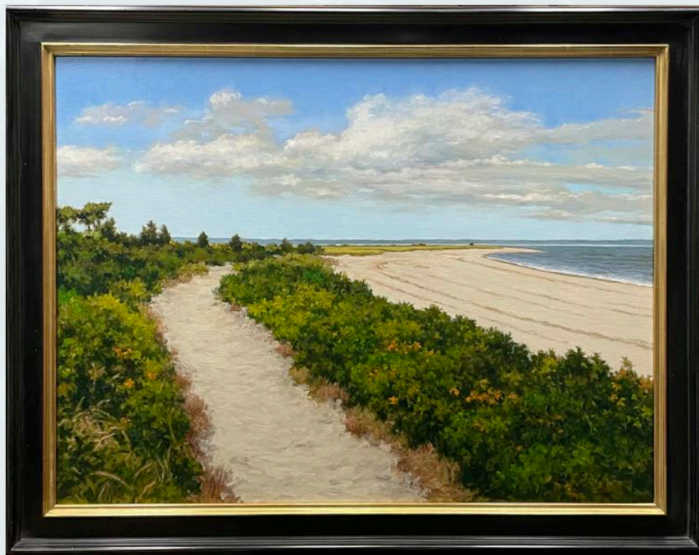
Caumsett in August , 30 x 40, oil on linen

I am thrilled to announce that this painting has been acquired by the Long Island Museum of Art, for their permanent collection