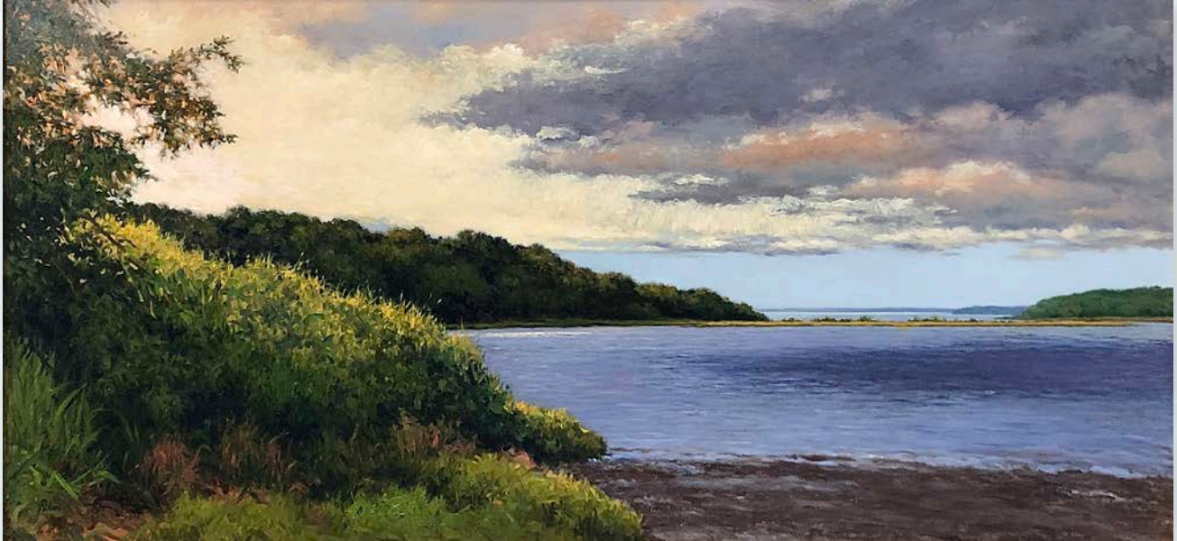
After the Storm , 24 x 48, oil on panel, $20,000