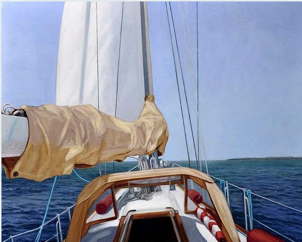
Out of the Office Today , 32 x 40, oil on linen, $19,500