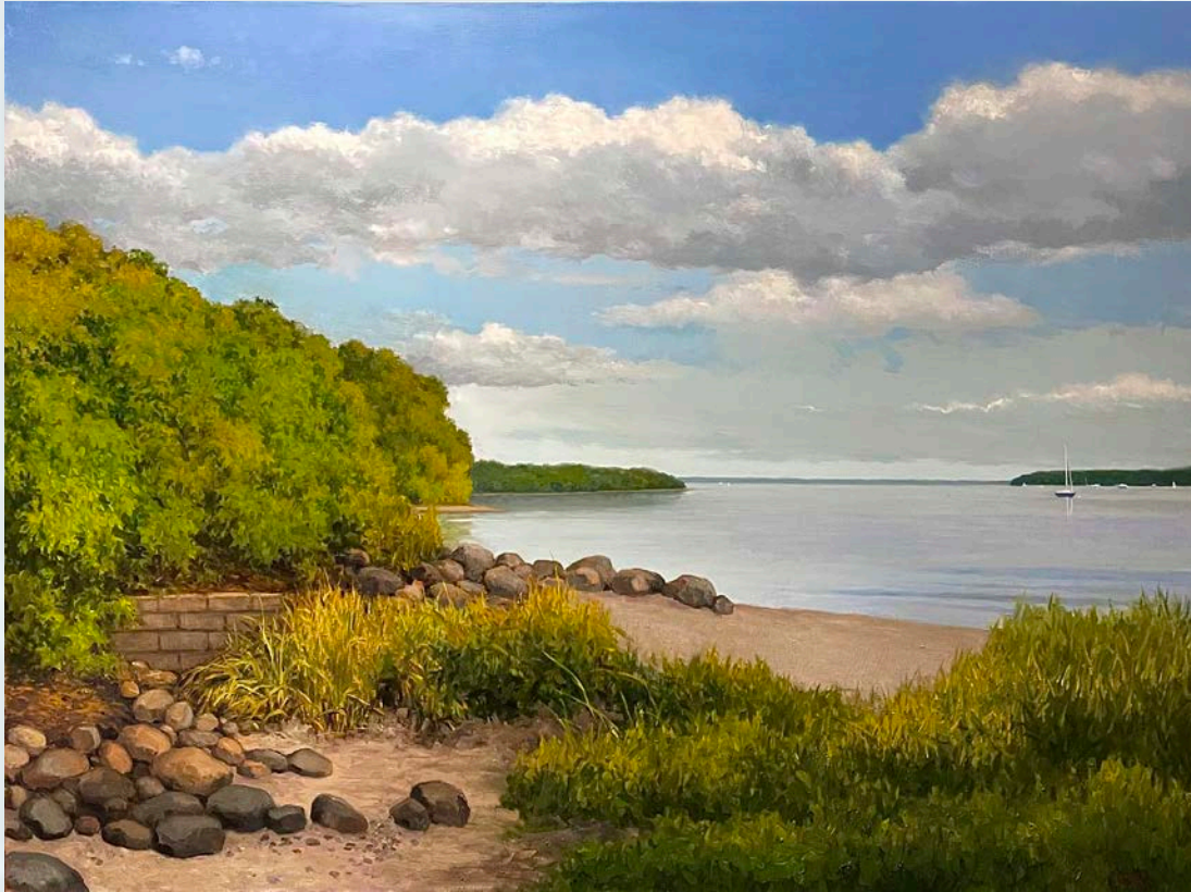
Morning on the Beach , 36 x 48, oil on linen, $25,000