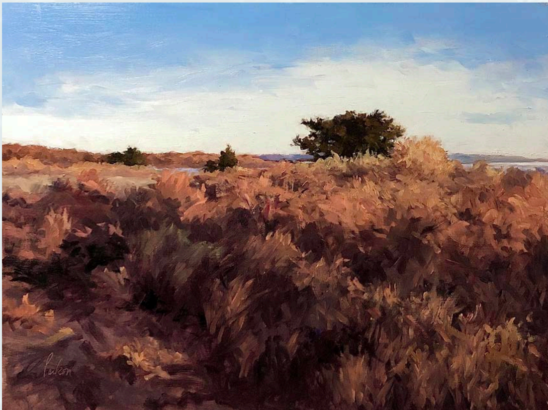
Study, Long Beach, Sag Harbor , 12 x 16, oil on panel, $3,000