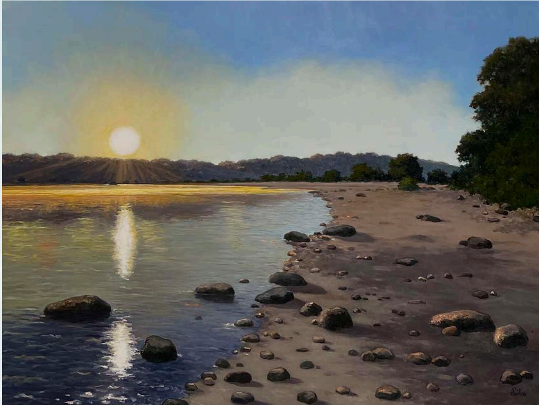
New Dawn , 36 x 48, oil on linen, $25,000