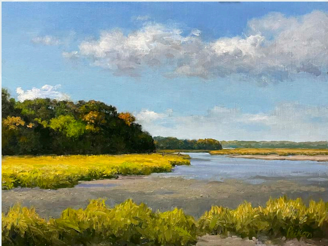
Low Tide, Stony Brook Harbor , 9 x 12, oil on panel, $2,200