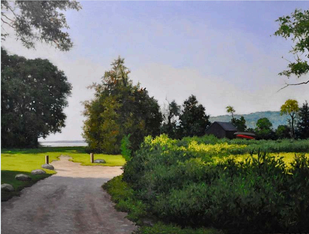
Beach Path , 21 x 28, oil on linen, $8,000