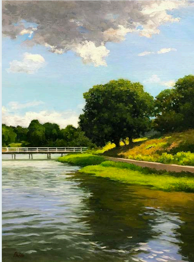
Afternoon at the Yacht Club , 16 x 12, oil on panel, $3,000