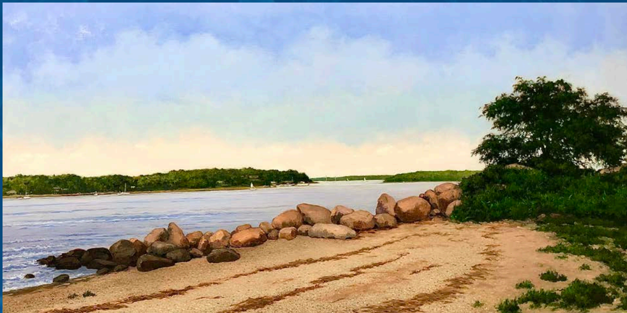
Roosevelt's Jetty , 24 x 48, oil on linen, $20,000

Having lived my entire life on an island, it should come as no surprise that I have spent countless hours painting water. There is endless inspiration to be found around us if we take the time to look. The textures and colors vary by season and time of day, waiting to be captured on my canvas and shared with my viewers.