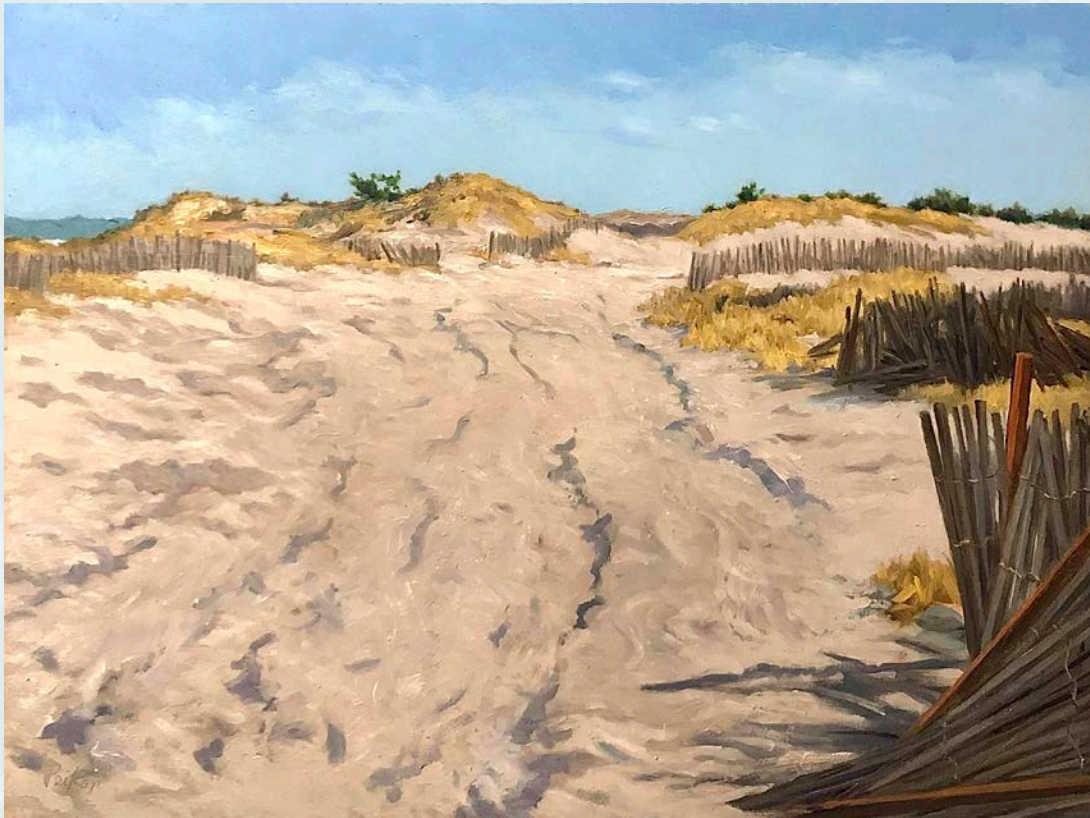
Windswept , 12 x 16, oil on linen, $3,000