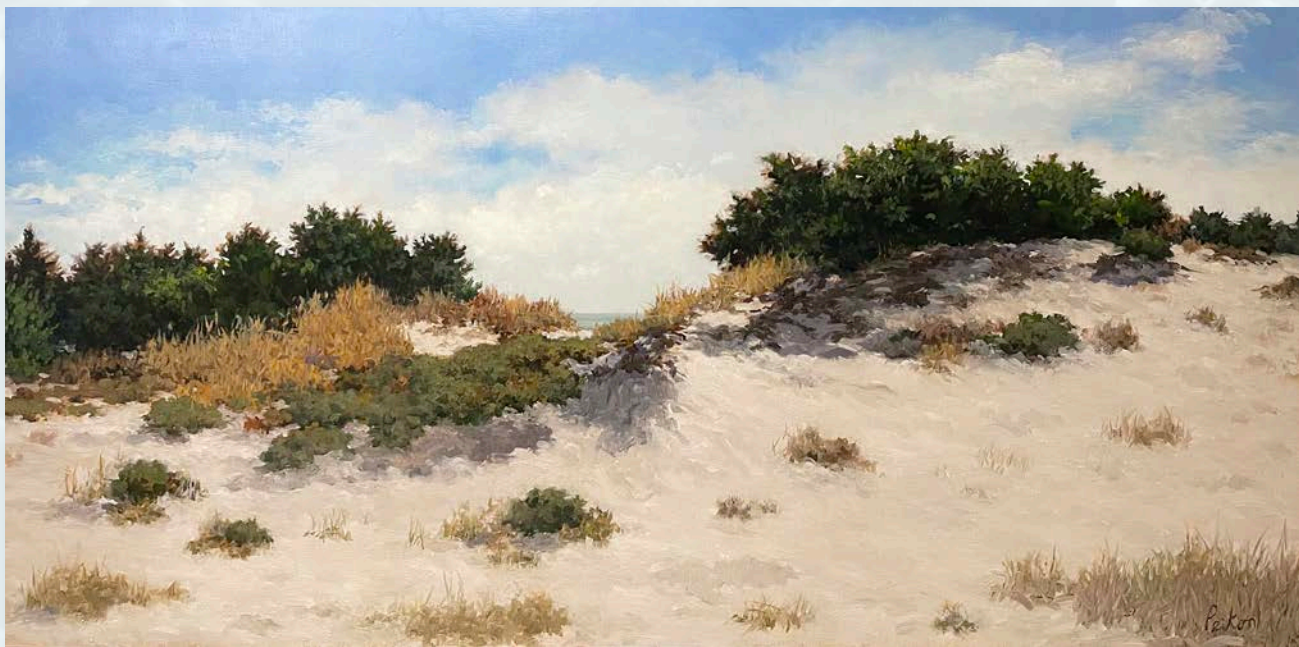
Summer in the Dunes , 24 x 48, oil on linen, $20,000