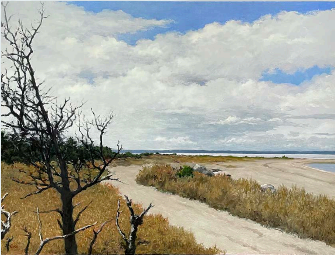
Caumsett, Winter Walk , 30 x 40, oil on linen, $18,000