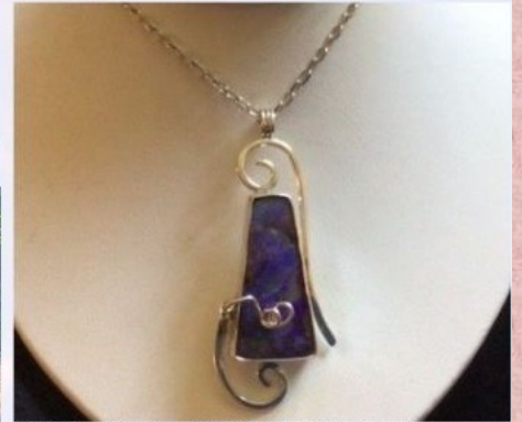
Marla Mencher, sterling with purple opal geometric