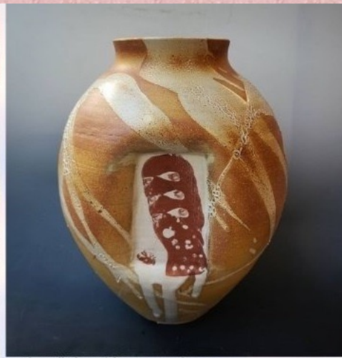
Justin Mullady, "Stick Up", ceramic vase